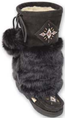
980442 BL • LADIES / DAMES