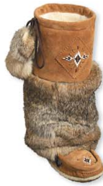
980447 MO • LADIES / DAMES