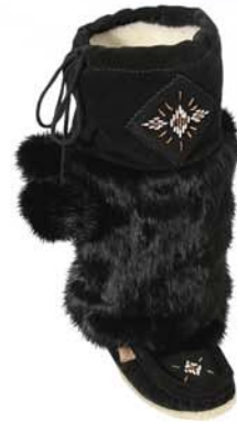
980447 BL • LADIES / DAMES