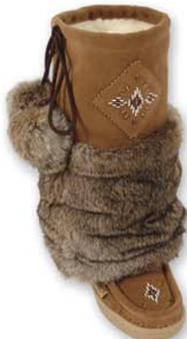
980442 MO • LADIES / DAMES