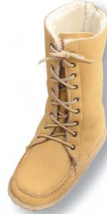
9048 DT • MEN / HOMMES