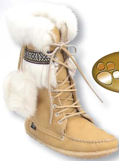
9044 DT • LADIES / DAMES