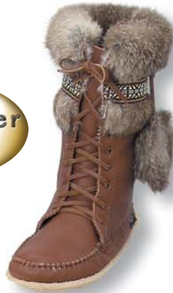
9045 AMK • LADIES / DAMES